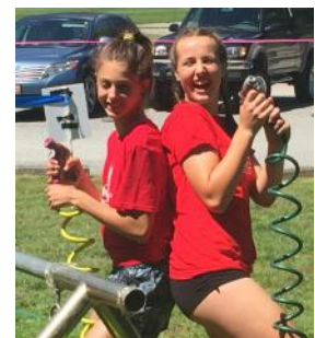
Volunteer Bike Wash Station @ 2018 BC Bike Race